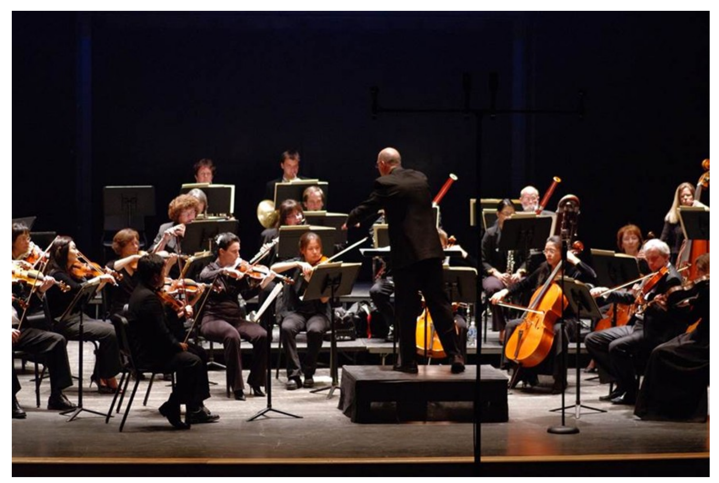
Bay Atlantic Symphony Orchestra

Bay Atlantic Symphony is known as an outstanding professional orchestra that presents music with emotion and nuance, and also as a model of what a 21st Century Arts organization can mean to a region. BAS performs 14-17 orchestral programs and dozens of intimate community-based concerts annually, drawing musicians and audiences from throughout the Delaware Valley as well as New York and Baltimore.