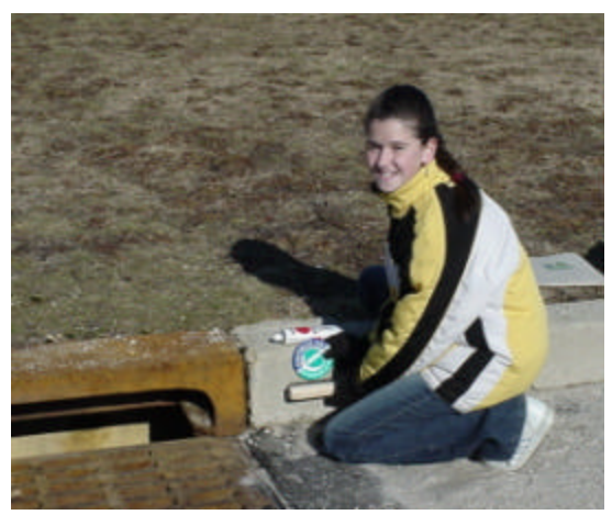
A GTMS student participated in a civics project to mark the storm drains around the municipal complex drive.

Use a commercial car wash for washing your car. These facilities, by law, have closed systems for their detergents and therefore will not allow run-off into storm drains and groundwater. If you must wash the car at home, use non-phosphate detergent.